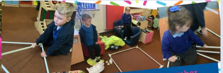
We used our number matching skills and worked together to follow assembly instructions to build our new class tent and reflection space.