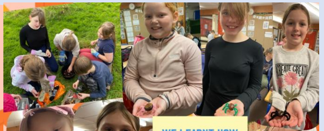
WE LEARNT HOW TO USE A GIMLET TO MAKE HOLES IN A CONKER AND ADDED PIPE CLEANERS TO MAKE MINIBEASTS.