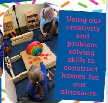
Using our creativity and problem solving skills to construct homes for our dinosaurs.