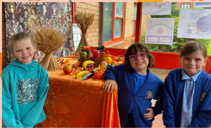
OUR CLASS 2 SCHOOL COUNCIL MEMBERS CREATED OUR HARVEST DISPLAY IN THE FOYER.