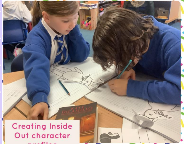
Creating Inside Out character profiles