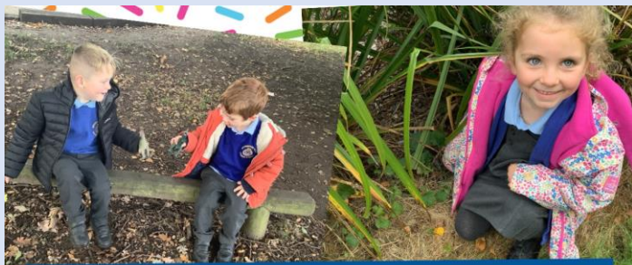
This week we took our dinosaurs on an adventure outside. Following this we wrote short stories and postcards about what they did on their 'day out'.