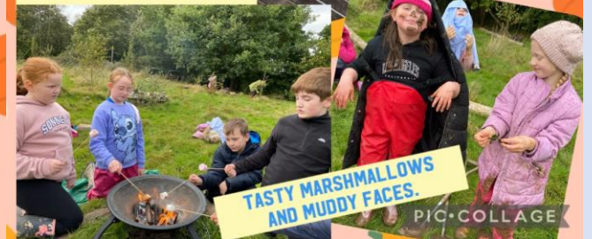
TASTY MARSHMALLOWS AND MUDDY FACES.