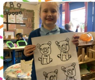
Using complementary colours in the style of Andy Warhol