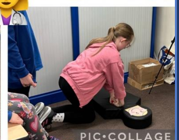
CLASS 3 LEARNING BASIC FIRST AID