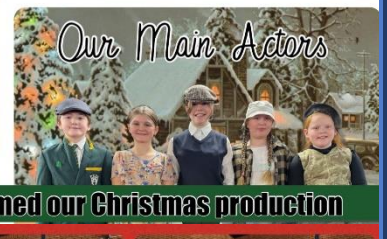
Class 3 prepared and performed our Christmas production