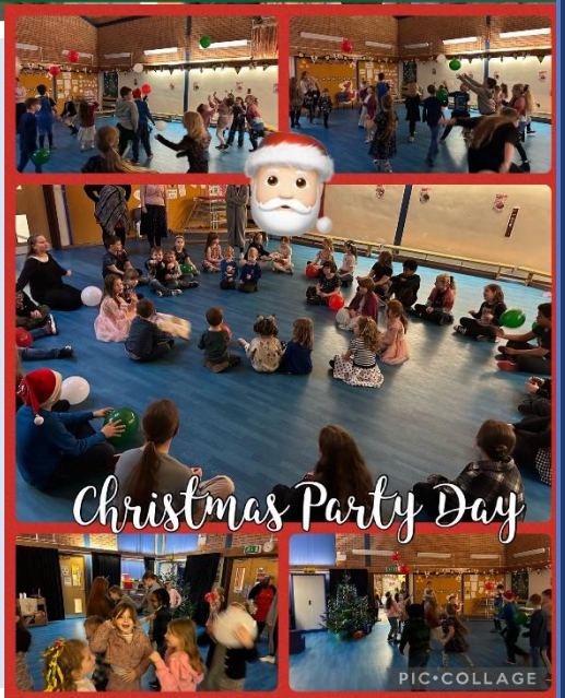
Christmas Party Day