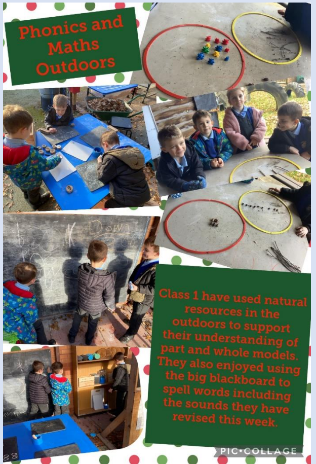
Phonics and Maths Outdoors