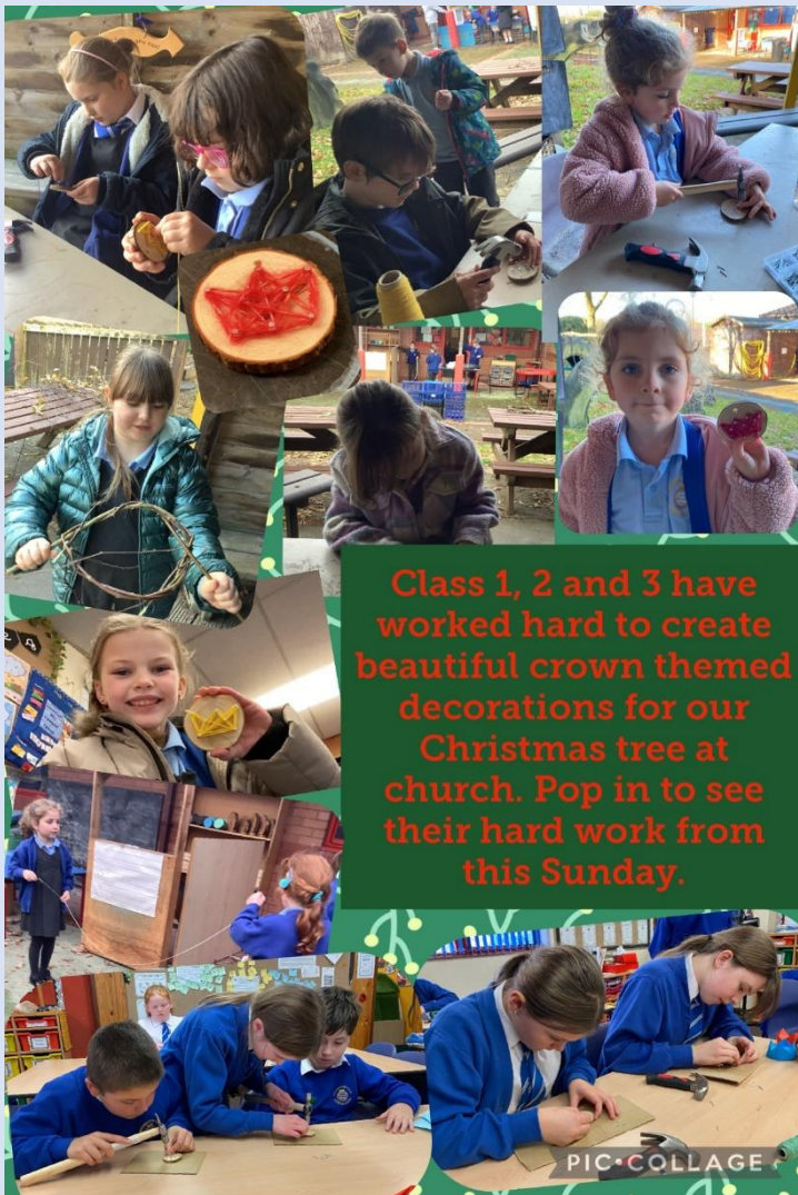
Class 1, 2 and 3 have worked hard to create beautiful crown themed decorations for our Christmas tree at church. Pop in to see their hard work from this Sunday.