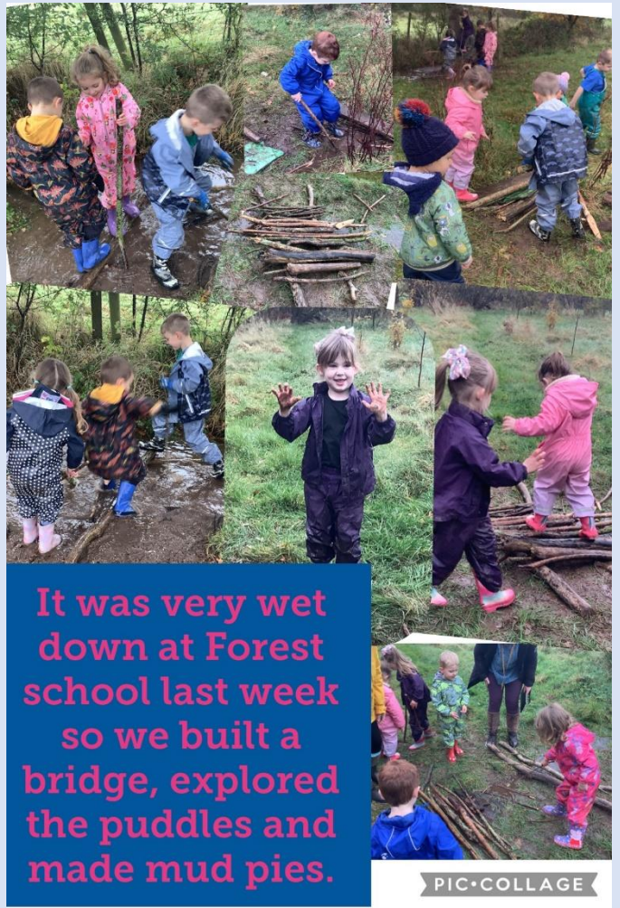
It was very wet down at Forest school last week so we built a bridge, explored the puddles and made mud pies.