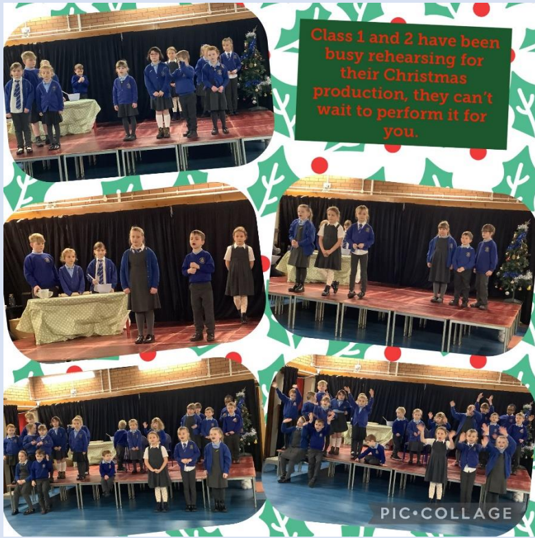
Class 1 and 2 have been busy rehearsing for their Christmas production, they can't wait to perform it for you.