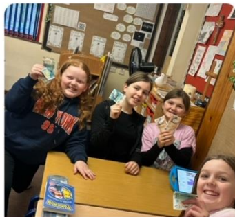
Entrepreneur club starting their small businesses with their starter cash...