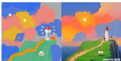
Our AI artwork linked to Ynys Llanddwyn, home of Santes Dwynwen

Finally, our entrepreneur's club have spent their starter cash and will be starting to make items to sell ready for Mother's Day and Easter. Watch this space!