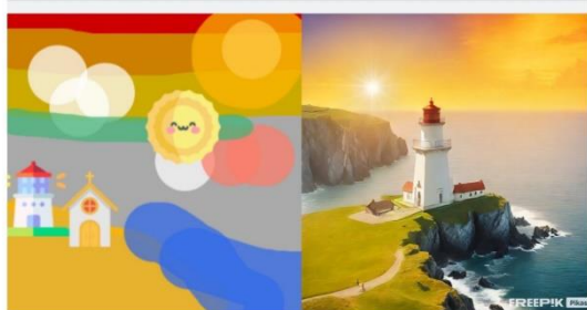
Try it out yourself Freepik.com/pikaso