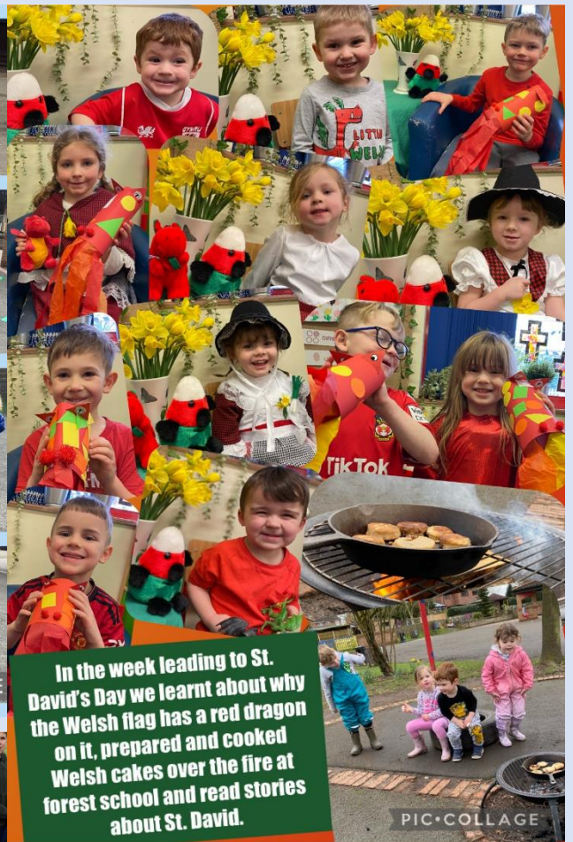
In the week leading to St. David's Day we learnt about why the Welsh flag has a red dragon on it, prepared and cooked Welsh cakes over the fire at forest school and read stories about St. David.