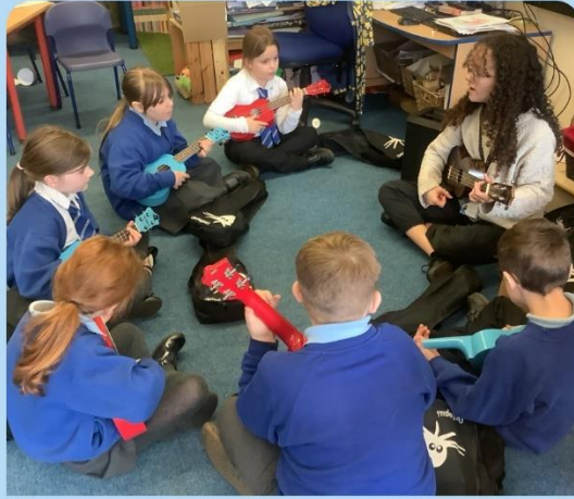
Cana came to teach us about harmony.