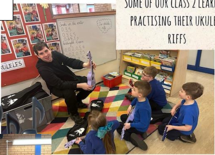
SOME OF OUR CLASS 2 LEARNERS PRACTISING THEIR UKULELE RIFFS