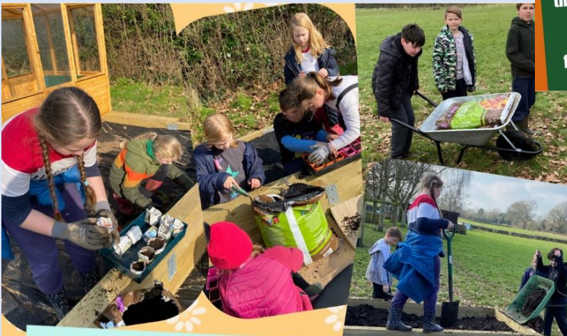
We've made lots of progress in our new garden area this week. Class 1 and 2 have planted fruit trees and bushes along with wild garlic and bluebells. Class 3 helped to move nearly 2 tons of soil and sowed our first vegetable seeds.