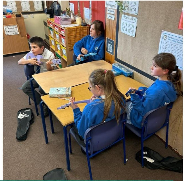
Class 3 had a Ukulele lesson on Monday! We learnt how to play 3 different chords!