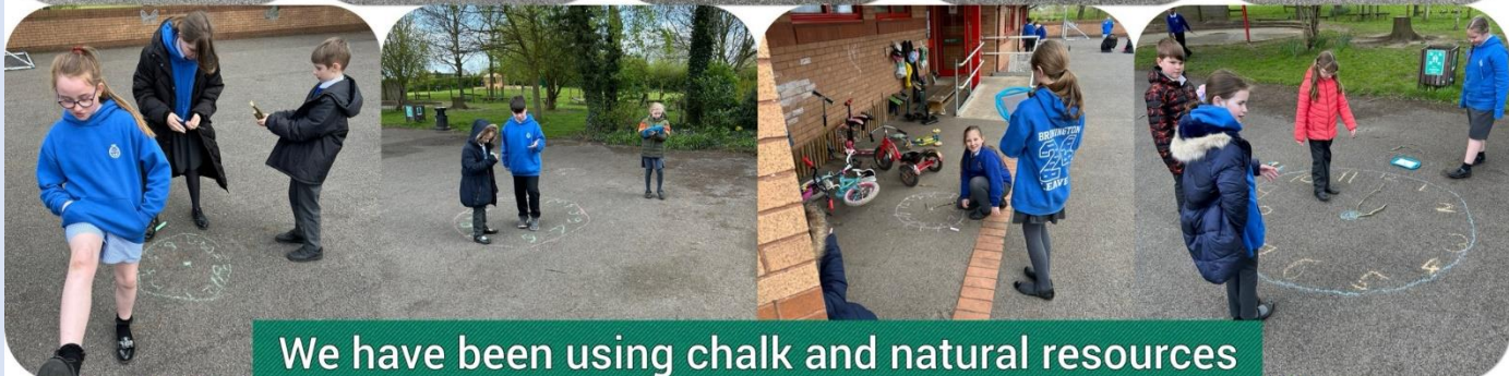
We have been using chalk and natural resources to make clocks outside!